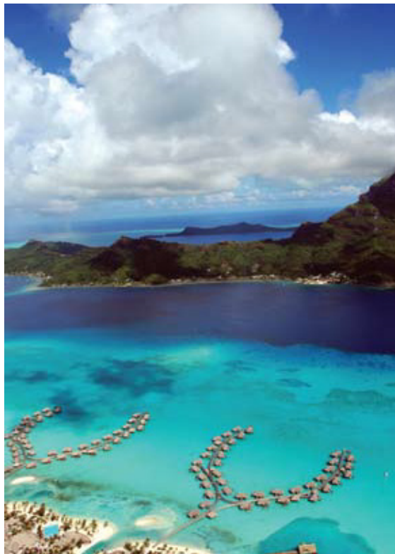
InterContinental Bora Bora Resort & Thalasso Spa

Don't forget to ask our wedding specialists for special rates. You can view our hotels at: www.intercontinental.com