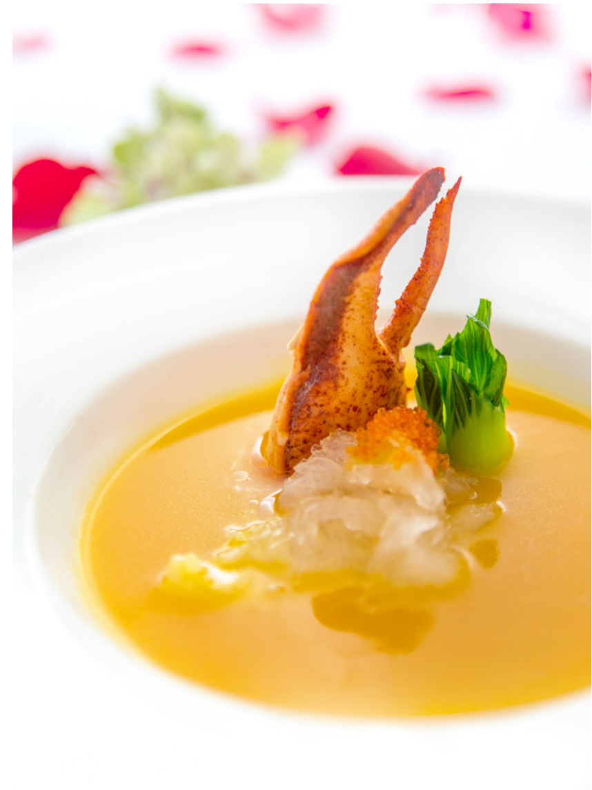
Braised North Canadian Lobster Claw with Bird's Nest, Fish Maw in Golden Broth

Garoupa Machhere Jhol (Bengali Garoupa Fish Curry)