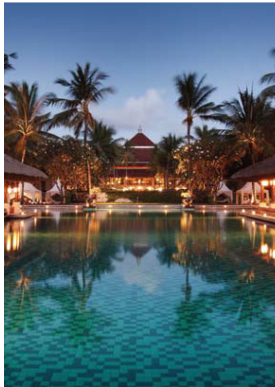
InterContinental Bali Resort