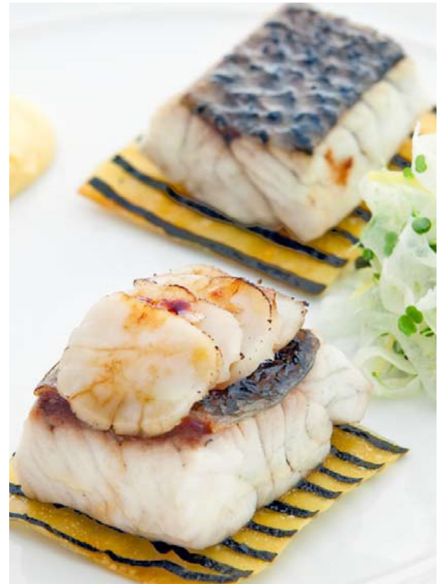
Grilled barramundi filet, Queensland scallops with sweet corn purée, and baby fennel salad